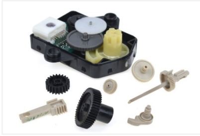
[Foto 5] Heat-, blister- and chemical-resistant: Exhibited by Kuraray at Fakuma 2018, Genestar is a highly robust engineering plastic that is ideal for processing by extrusion and injection molding.