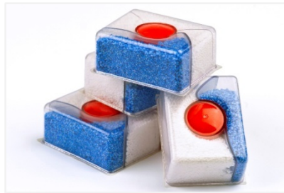
[Foto 6] Customized and water-soluble: The polymer Mowiflex from Kuraray is suitable for many applications ranging from injection molding to additive manufacturing. Demonstrably biodegradable in water, Mowiflex is the ideal carrier material in 3D printing and for the production of automatic dishwasher tablets.