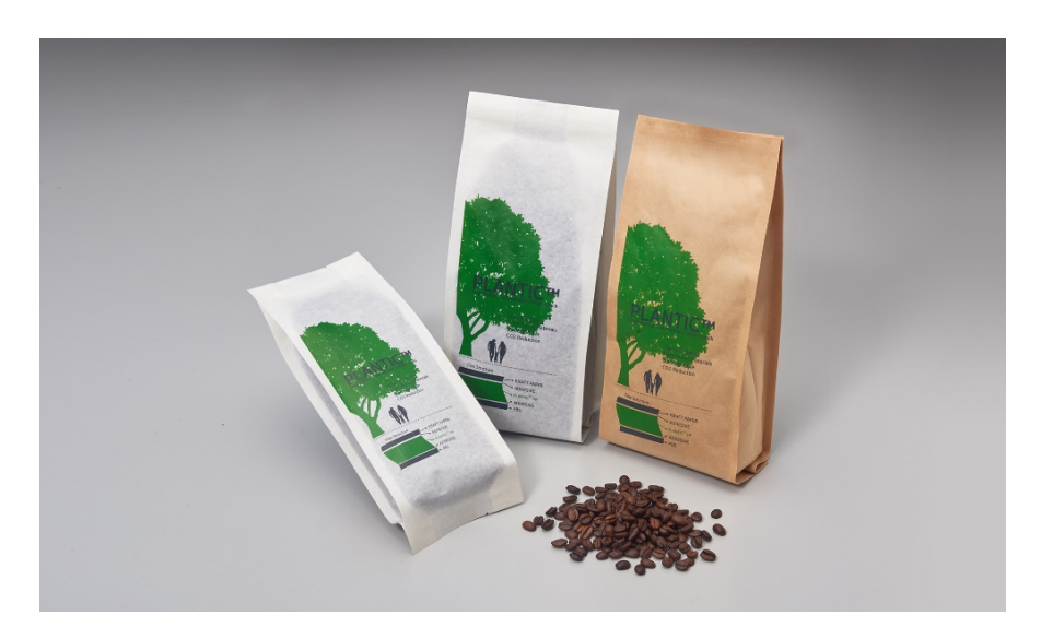
[Photo 2] Innovation to improve sustainability: careful use of natural resources is important to Kuraray when developing new materials. One example is Plantic™ biopolymer [produced by PLANTIC™ Technologies Limited (a member of the Kuraray Group)]. Renewable starch makes up over 80 percent of this biodegradable barrier material. Its high barrier properties keep oxygen out of packaging and maintain the flavour and aroma of the contents - for example, coffee, snacks and sweets.